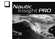
Nautic Insight™ PRO V16 mapping card ($99 Retail Value)