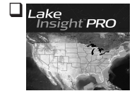
Lake Insight™ PRO V16 mapping card ($99 Retail Value)